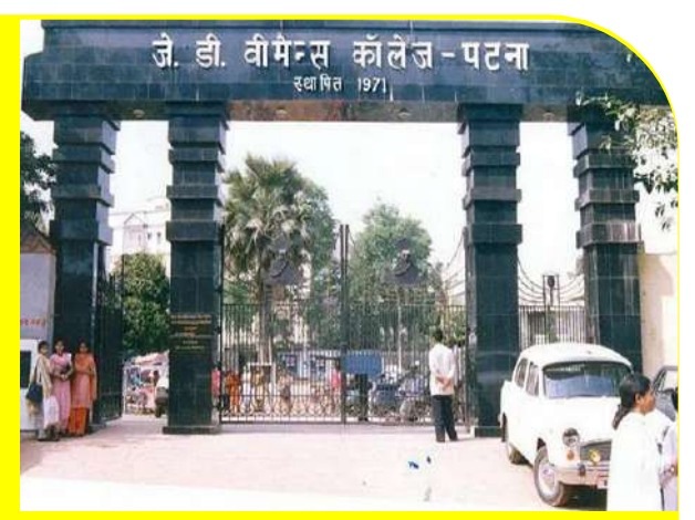
Bailey Road, Patna - 800023 Bihar

As an institution of learning it has a commanding presence both in the University as well as in the capital of the state. The college while maintaining its exemplary record in University examinations has also emerged as a serious contender in inter University competitions winning large number of prizes.